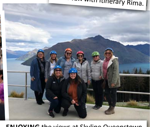
ENJOYING the views at Skyline Queenstown.