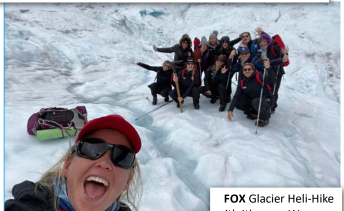
FOX Glacier Heli-Hike with Itinerary Waru.