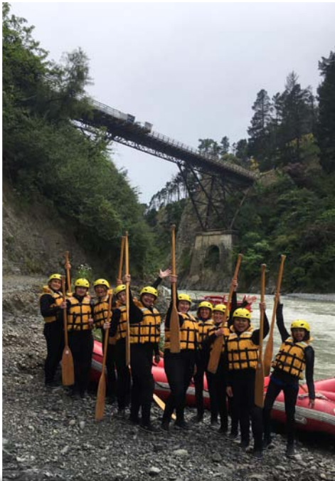
HANMER Springs Rafting with Itinerary Whitu.

To discover itineraries, Good Morning World videos and photos, visit Tourism New Zealand's travel trade website by CLICKING HERE .