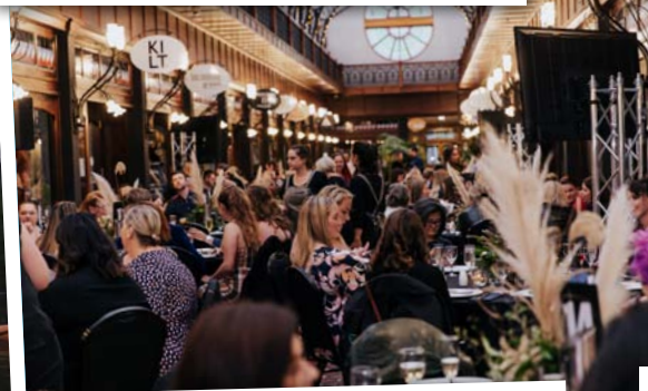
FAREWELL Function, Christchurch.