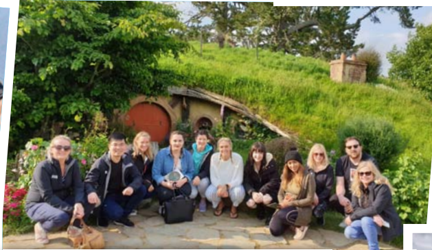
HOBBITON , Matamata with Itinerary Toru.