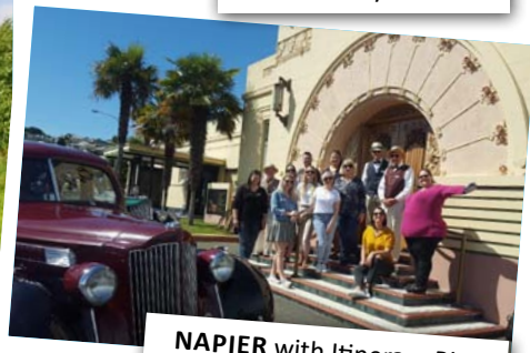
NAPIER with Itinerary Rima.