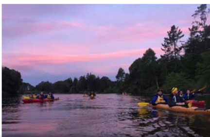
WAIMARINO Kayak Tours, Tauranga.