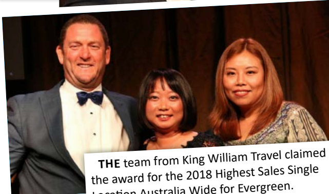
THE team from King William Travel claimed the award for the 2018 Highest Sales Single Location Australia Wide for Evergreen.