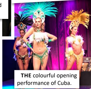
THE colourful opening performance of Cuba.