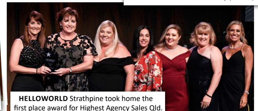
HELLOWORLD Strathpine took home the first place award for Highest Agency Sales Qld.