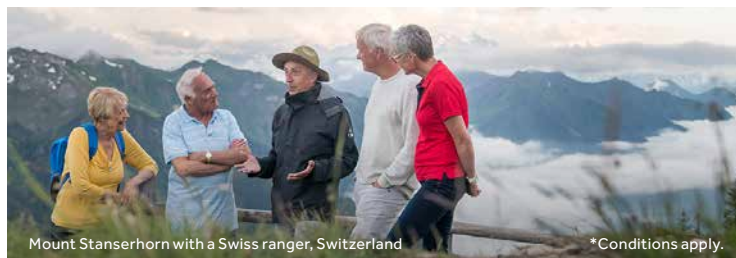
Mount Stanserhorn with a Swiss ranger, Switzerland

*Conditions apply, available at www.qhv.com.au