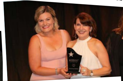
THE Highest Agency Sales Vic winner Helloworld Lower Templestowe.