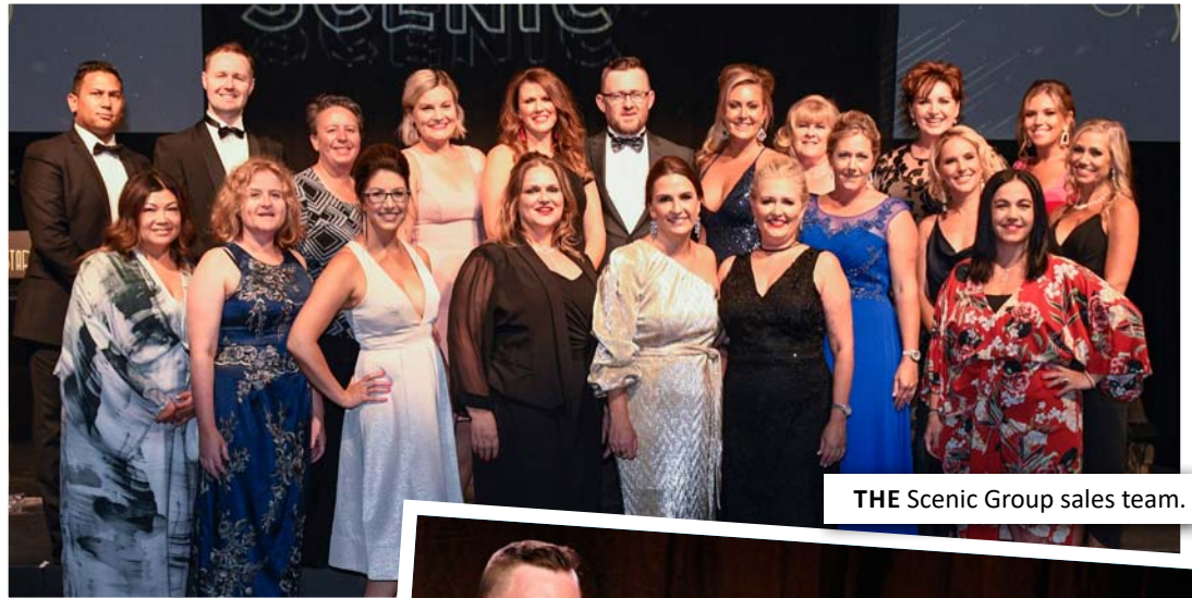
THE Scenic Group sales team.

Group General Manager, Sales & Marketing Australia/Asia Pacific,