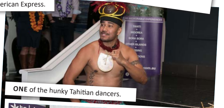
ONE of the hunky Tahitian dancers.