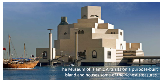
The Museum of Islamic Arts sits on a purpose-built island and houses some of the richest treasures.