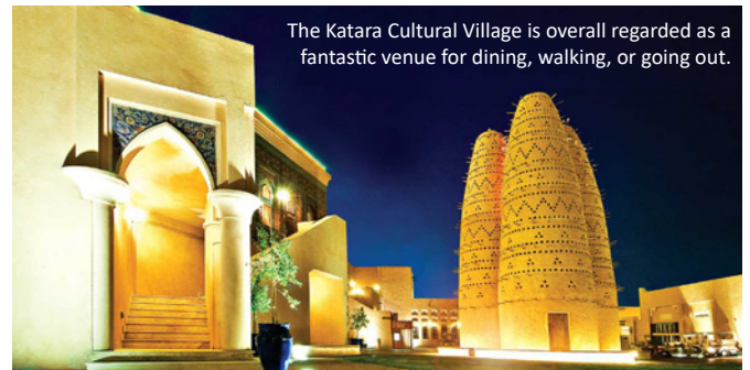
The Katara Cultural Village is overall regarded as a fantastic venue for dining, walking, or going out.