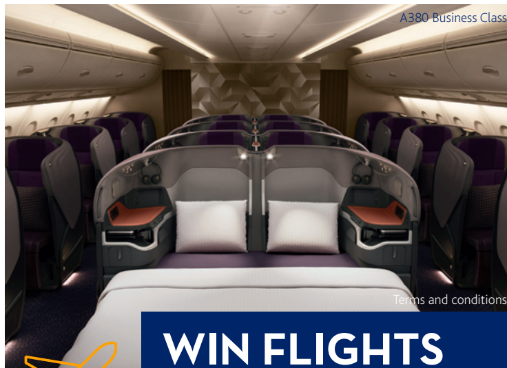
A380 Business Class