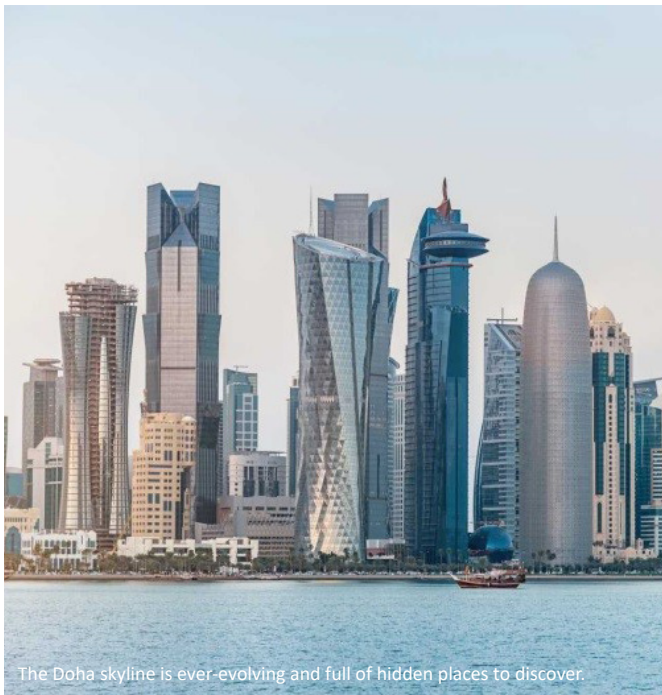
The Doha skyline is ever-evolving and full of hidden places to discover.