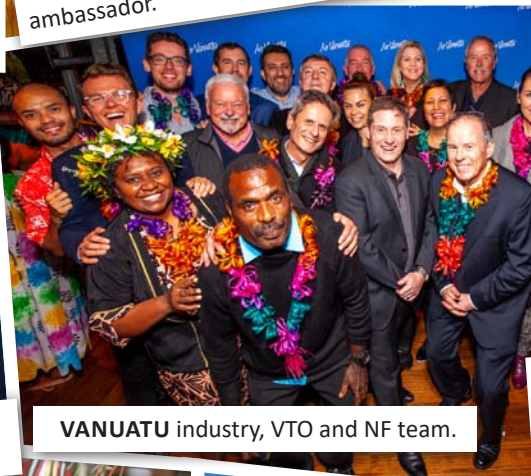
VANUATU industry, VTO and NF team.