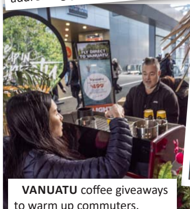
VANUATU coffee giveaways to warm up commuters.