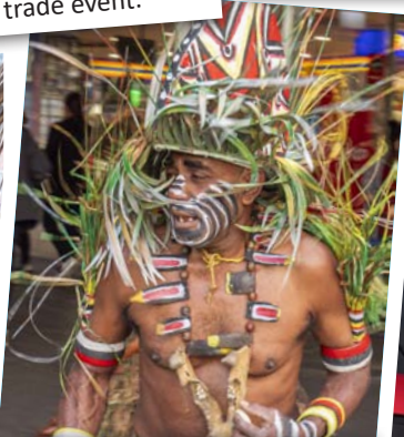
NI-VAN dancer from the Banks Islands.