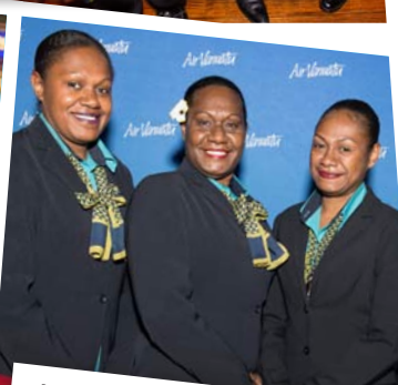
WARM Vanuatu smiles await passengers on board Air Vanuatu.