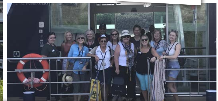
AGENTS boarding their home for the week to cruise the Lower Danube between Giurgiu, Romania and Budapest, Hungary.