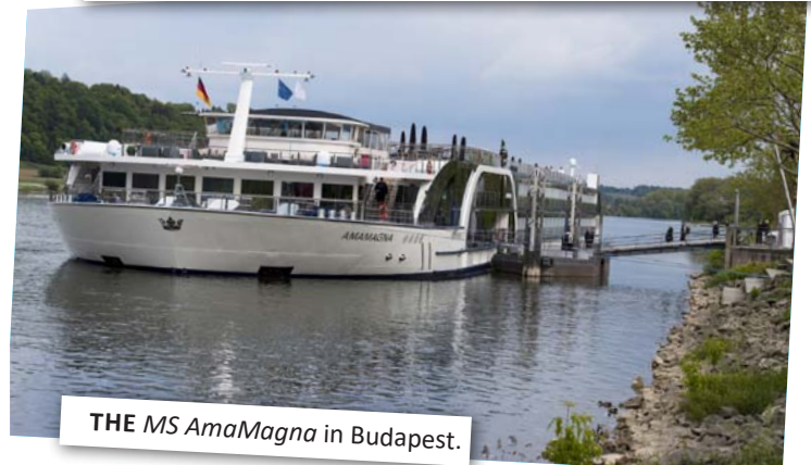
THE MS AmaMagna in Budapest.