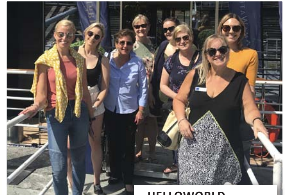
HELLOWORLD Travel agents had the opportunity to inspect APT's brand new AmaMagna while in Budapest.

APT also treated agents to an exclusive inspection of its newest European river cruise ship, the MS AmaMagna , in Budapest.