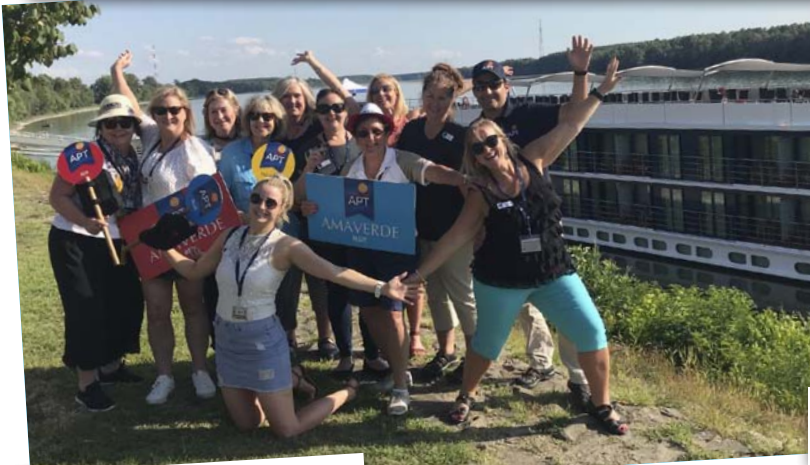
THE group of Helloworld Travel agents enjoying the sunshine on the Lower Danube.