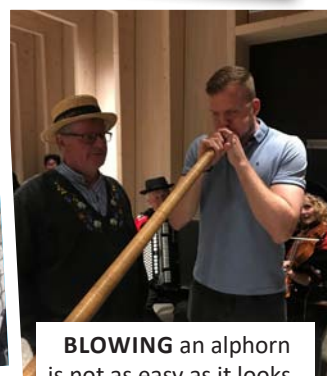
BLOWING an alphorn is not as easy as it looks.

FOR soccer fans, the FIFA museum is a must.