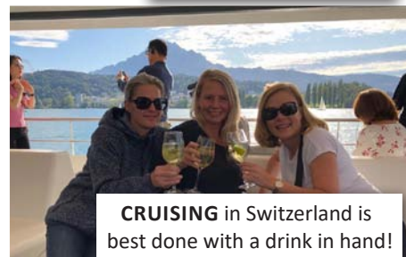
CRUISING in Switzerland is best done with a drink in hand!