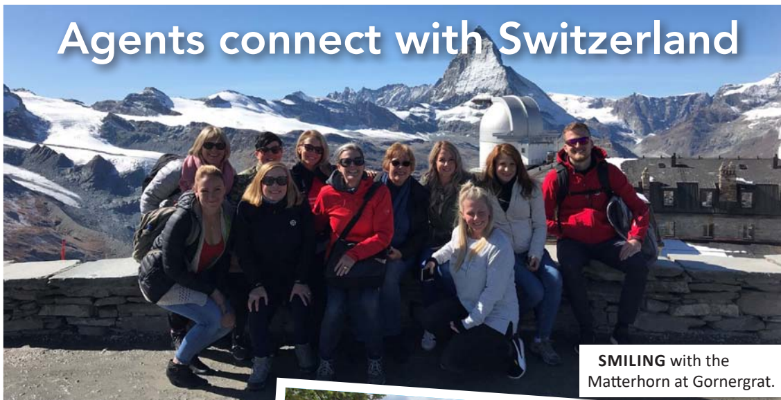
SMILING with the Matterhorn at Gornergrat.

The Schilthorn and its revolving Piz Gloria restaurant was another highlight, as was Jungfrauoch, Top of Europe, home to the highest mountain railway. Before heading home, agents visited Zermatt, home of the iconic Matterhorn.