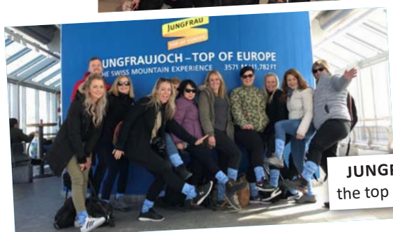
JUNGFRAUJOCH , the top of Europe.