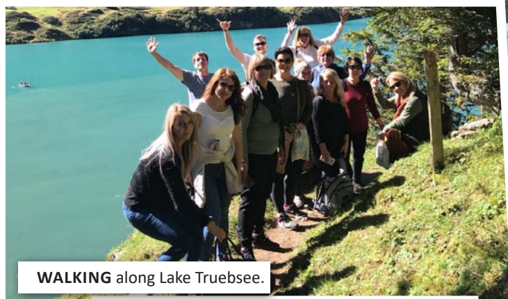
WALKING along Lake Truebssee.