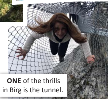
ONE of the thrills in Birg is the tunnel.