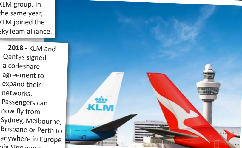
2018 - KLM and Qantas signed a codeshare agreement to expand their networks. Passengers can now fly from Sydney, Melbourne, Brisbane or Perth to anywhere in Europe via Singapore.