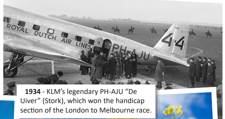
1934 - KLM's legendary PH-AJU "De Uiver" (Stork), which won the handicap section of the London to Melbourne race.