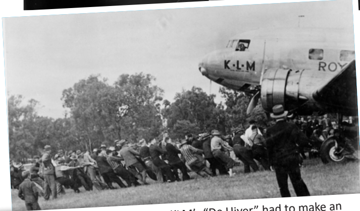
1934 - Due to terrible weather, KLM's "De Uiver" had to make an emergency landing in Albury, NSW. The aircraft sank into the mud and the local population gathered to pull it out so it could continue its journey.