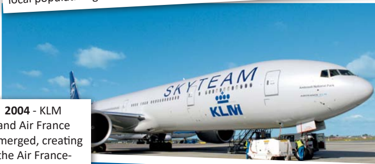
2004 - KLM and Air France merged, creating the Air France-KLM group. In the same year, KLM joined the SkyTeam alliance.