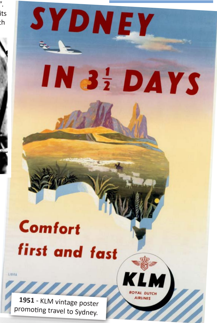
1951 - KLM vintage poster promoting travel to Sydney.