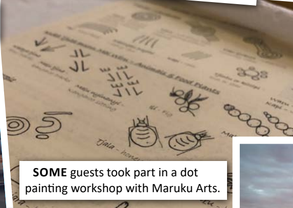
SOME guests took part in a dot painting workshop with Maruku Arts.