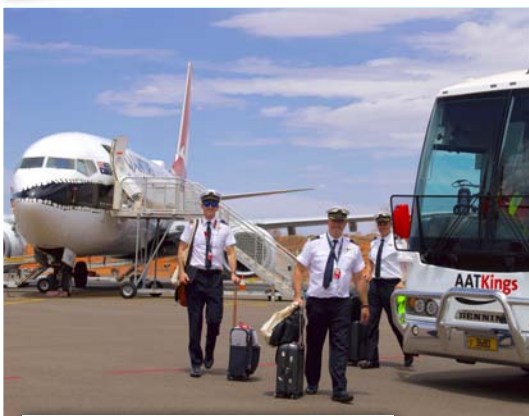
QANTAS flight crew arriving into Ayers Rock Airport.