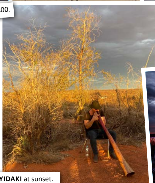
YIDAKI at sunset.