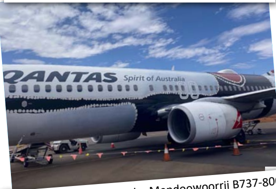
PASSENGERS flew on the Mendoowoorrji B737-800.