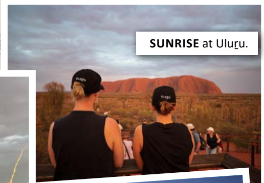
SUNRISE at Uluru.