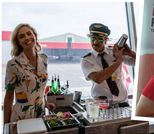
TROLLEY'D served cocktails infused with native plant botanicals.