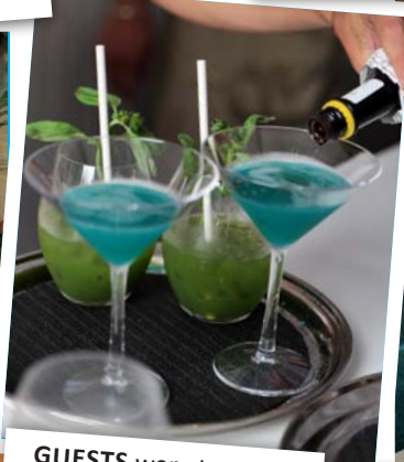
GUESTS were treated to freshly made cocktails.