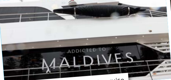
GUESTS enjoyed a private cruise around the harbour.