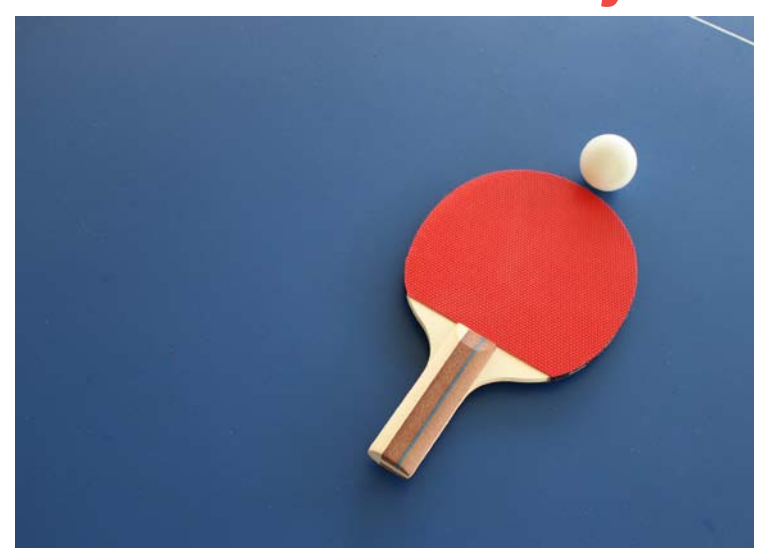
Table Tennis Day

TODAY is World Table Tennis Day, a day to celebrate the sport which is often played by people of all ages and skill levels.