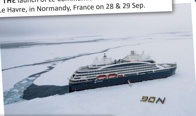
LE COMMANDANT CHARCOT reached the geographic North Pole on 06 Sep at 6:38pm AEST.