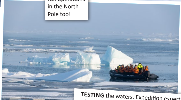
TESTING the waters. Expedition experts and crew explore and test Zodiacs during the dry run operations in the Arctic.