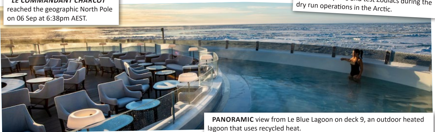
PANORAMIC view from Le Blue Lagoon on deck 9, an outdoor heated lagoon that uses recycled heat.