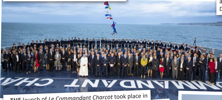
THE launch of Le Commandant Charcot took place in Le Havre, in Normandy, France on 28 & 29 Sep.