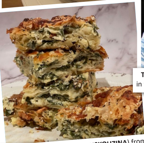
HELEN Demetriou (@HELENSKOUZINA) from Luxury Escapes sent in this family favourite Feta and Spinach Quiche Pie.