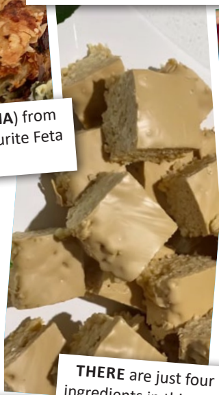
THERE are just four ingredients in this Cadbury Caramilk slice from Kylie Brady from KB 4 Travel & Cruise - check out the method by CLICKING HERE .