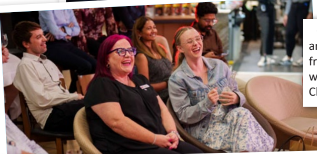
LATEST product updates from China Eastern Airlines and mastering the art of dumpling making.