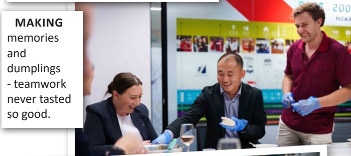
MAKING memories and dumplings - teamwork never tasted so good.