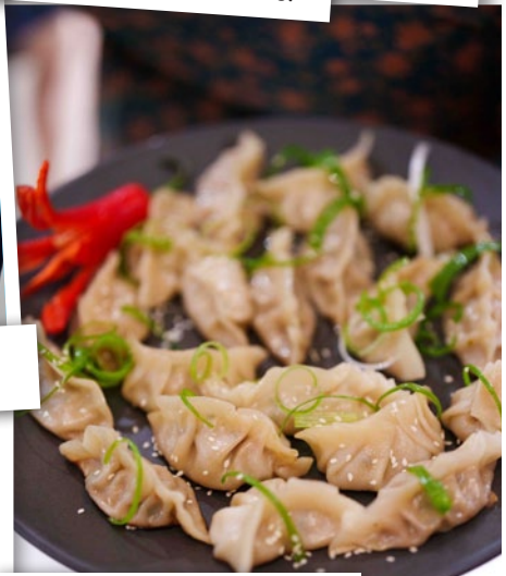
SILKY, delicious dumplings.