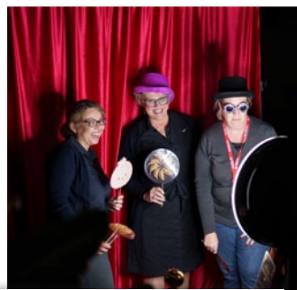
CAPTURING the moment - "1, 2, 3 - DUMPLINGS".