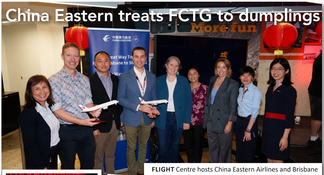
FLIGHT Centre hosts China Eastern Airlines and Brisbane Airport teams at FCTG HQ to present to local advisors.

Participants rolled up their sleeves and prepared hundreds of delicious dumplings, which were then expertly cooked and served alongside a selection of The Saucy Wench's award-winning condiments to great delight.