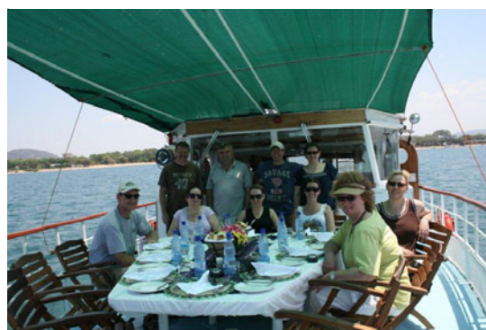
LEFT: Lunch on the lake.