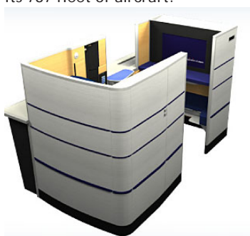
ABOVE: ANA's new First Class suite.

As the launch customer for Boeings' Dreamliner it's expected ANA will use the same product on its 787 fleet of aircraft.