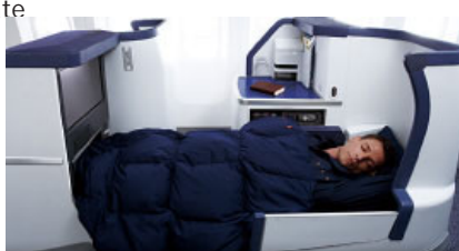
ABOVE: ANA's lie-flat Business product.