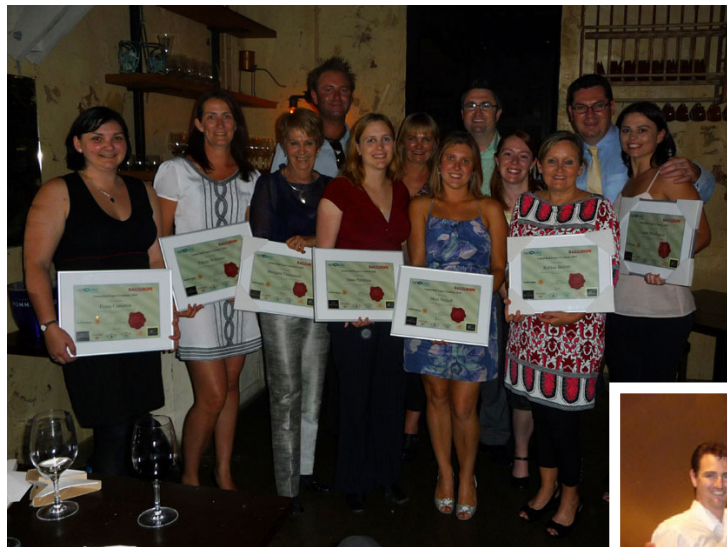
ABOVE: The NSW/ACT Graduates.

Below are some snapshots of the graduates enjoying the evenings and receiving their graduation certificates and prizes.