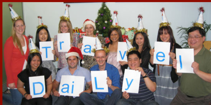
ABOVE: Hats off to the team at Discover the World Marketing!

TD's good friends at Fraser Suites Sydney are giving away an overnight's stay in a luxury Penthouse Apartment, sparkling wine & a fruit bowl upon arrival and complimentary car parking to the best photo received by 31 Dec, with bonus points awarded to entries featuring the TD issue.