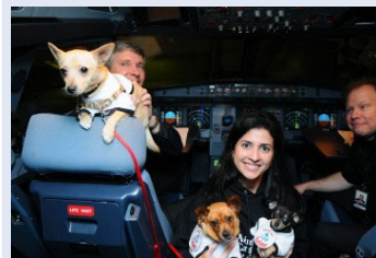
Any hot dogs on the menu?

The furry passengers were treated to a champagne cocktail, dubbed "Chi-mosas", cupcakes and doggie treats.