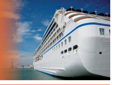
Chart a course towards these exciting new positions