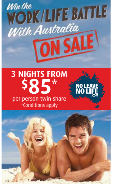
Over 170 Stay Pay deals with savings of up to 45%!