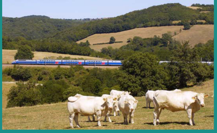
*Itinerary subject to change.

So put on those thinking caps and email your caption and contact details to railpluscomp@traveldaily.com.au. Full terms and conditions available at www.traveldaily.com.au