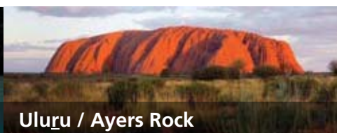
Uluru / Ayers Rock