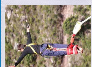
Bungee-jumping in South Africa

To enter, simply send in a caption that represents the adventure photo featured above. You can enter as many times as you want.