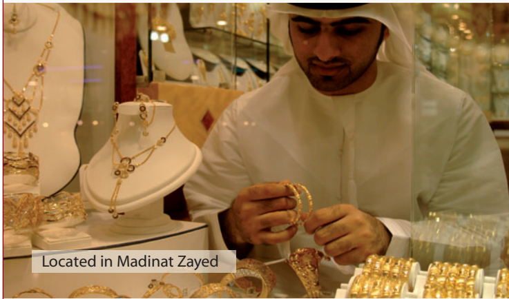
Located in Madinat Zayed

Abu Dhabi Tourism Authority is giving one Travel Daily reader and their guest a chance to indulge and luxuriate in the exotic and charming Abu Dhabi emirate. Fly return economy class to Abu Dhabi courtesy of V Australia celebrating their new flights from Sydney and spend a luxurious 5 night stay at the sophisticated Jumeirah at Etihad Towers near the fashionable corniche area. Enjoy a City Spectacular Tour, a Dune Dinner Safari and return airport transfers thanks to Arabian Adventures.