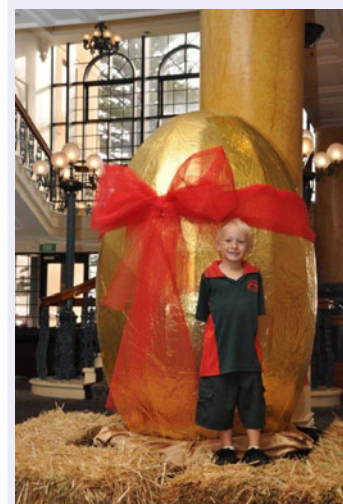
The Easter Bunny probably had a bit of trouble laying this one!

What we're all wondering is where the hotel will be able to hide the titanic treat for an Easter egg hunt on Sunday.