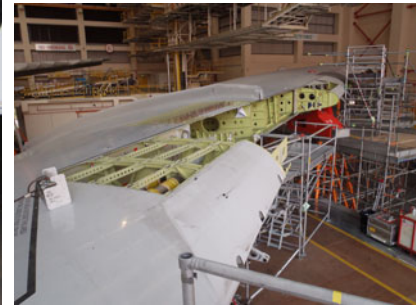
BELOW: The bottom skin of the wing also needed repairing with a massive section replaced (as outlined in red).

Unlike the top surface, the bottom skin was able to be fastened to the aircraft as the aerodynamics of the bottom edge are not as crucial.