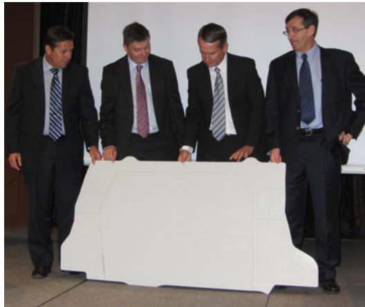
ABOVE: Qantas and Airbus executives pose with a replica of the top skin patch installed on Nancy-Bird Walton's left wing.

TD was the only Australian trade publication to be on the ferry flight.