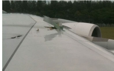
ABOVE: Rewind to 04 Nov 2010 with the chunk of metal that pierced the A380's top wing skin, and below fast-forward to now with the 'like new' mended wing.

The task was monumental given it was the first time a project like this had been attempted outside an Airbus facility.