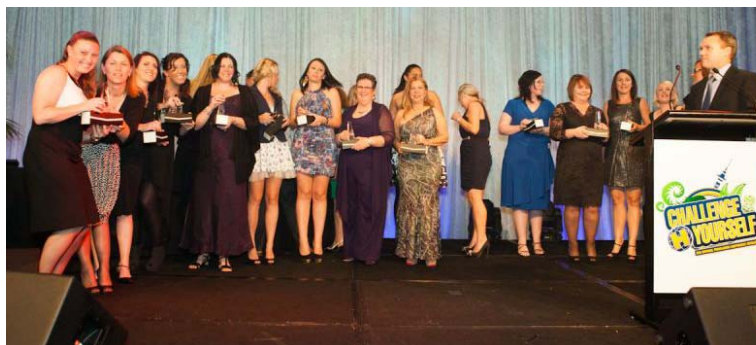
ABOVE: Winners of the Team 100 award, which celebrates the Top 100 selling consultants in the Harvey World Travel network.