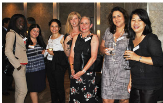
LEFT: The lovely SAA ladies.