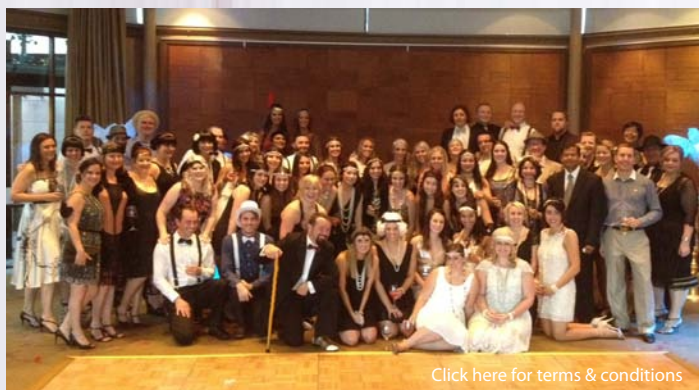
Click here for terms & conditions

Pictured: The Wendy Wu Tours team enjoyed their Christmas party at L'Aqua, Cockle Bay in Sydney last Fri 20 December with a Great Gatsby theme enthusiastically embraced by the over 70 attendees.