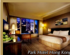
Park Hotel Hong Kong