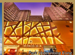
Park Hotel Hong Kong

Send your entries to: parkhotelcomp@traveldaily.com.au