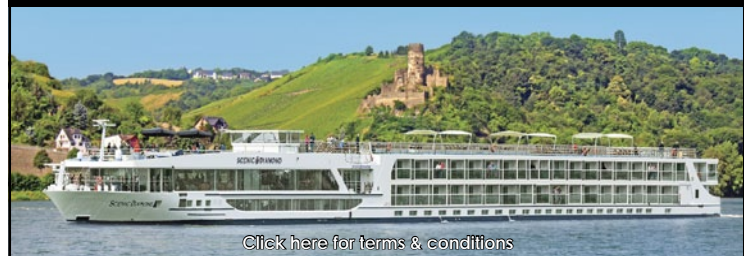
Click here for terms & conditions

Q.16: List one Scenic FreeChoice experience available in Vienna on the 15 Day Jewels of Europe River Cruise program.