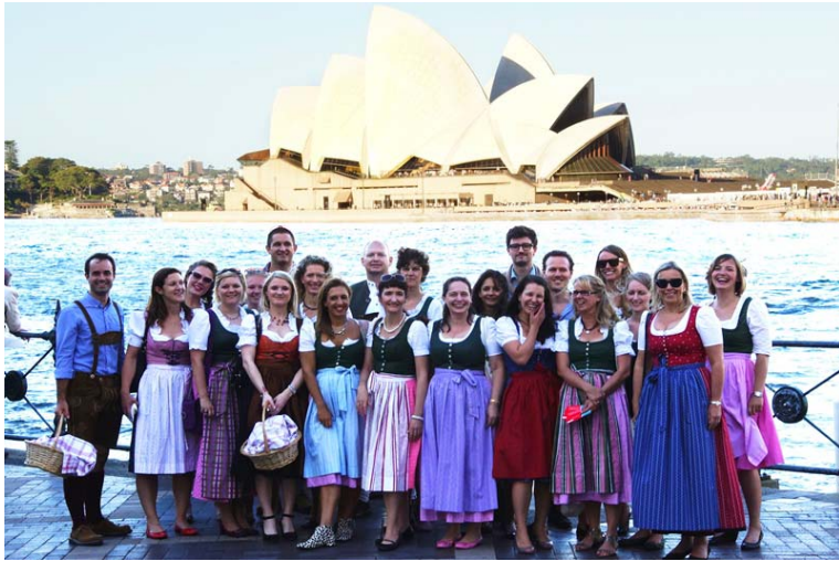
ABOVE: The group of Dirndl Ambassadors gathered in front of the Opera House at Circular Quay.

AFTER their attempt at Taronga Zoo to make koalas flirt back ( TD 21 Feb), the Austrian Dirndl Ambassadors took a multicultural approach at their two most recent outings.