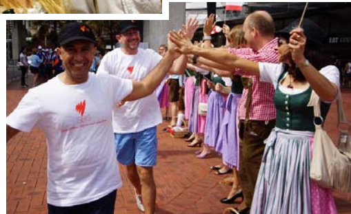
ABOVE: High fives for the SBS Dragon Boat crew.