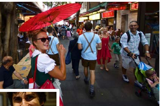
BELOW: A combination of cultures as Chinese New Year’s tradition meets Austrian fashion tradition.