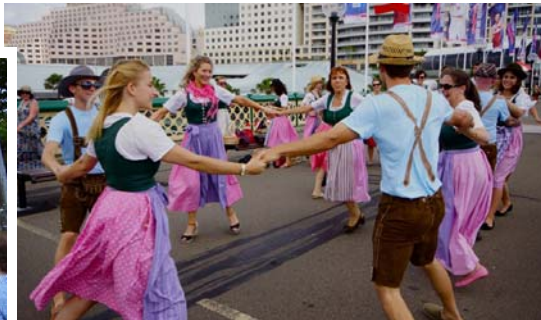
LEFT: The Ambassadors engage in an impromptu waltz on the Pyrmont Bridge.