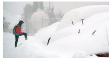
Dude, where's my car?

Falls Creek (pictured) received 40cm of fresh snow in the past 24hrs, while Perisher recorded a massive 70cm mid-mountain.