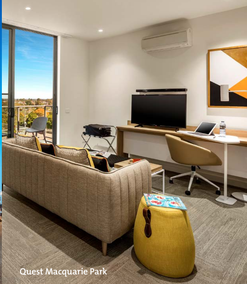
Quest Macquarie Park