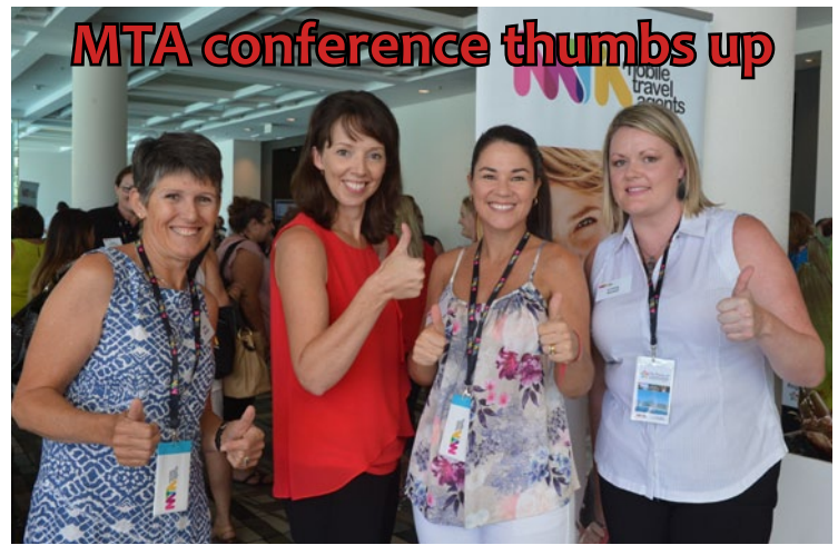
MTA conference thumbs up

For more information head to www.wendywutours.com.au or call 1300 727 998.