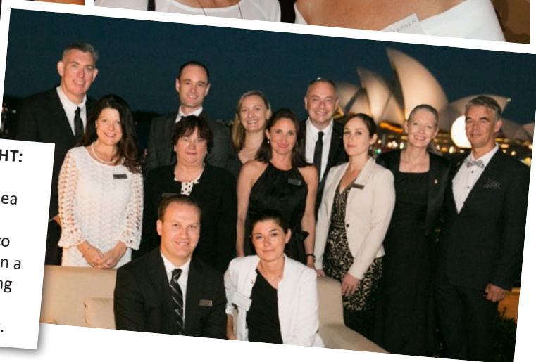
RIGHT: The Silversea and Monaco team on a sparkling Sydney evening.