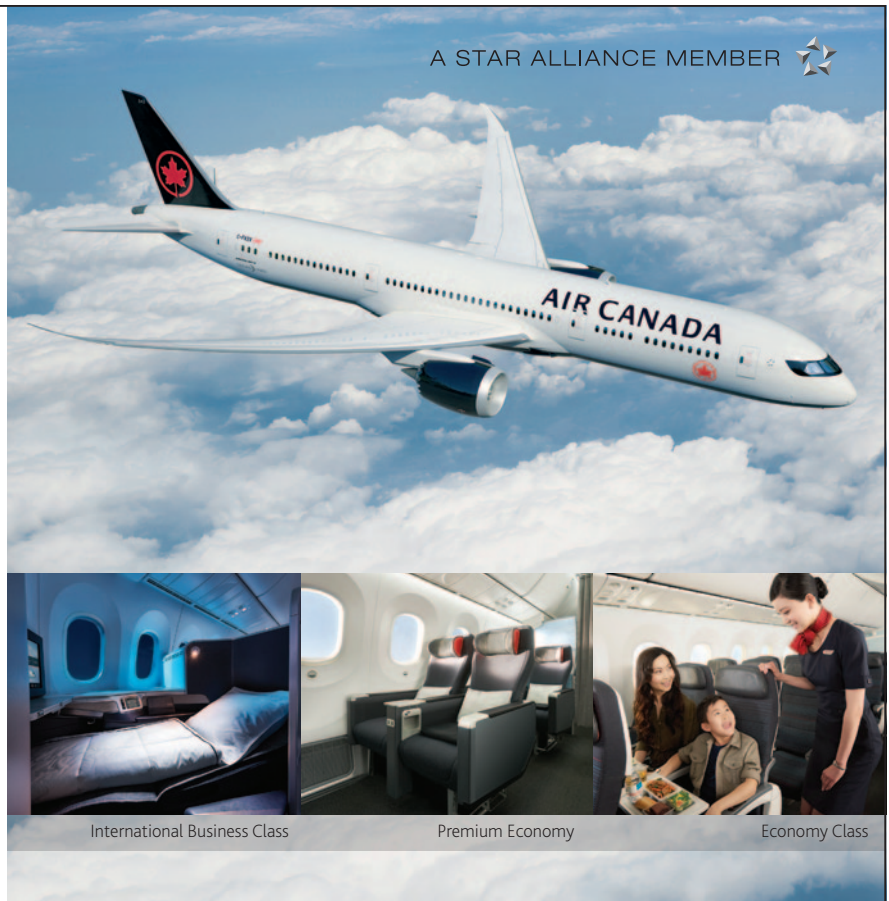
International Business Class