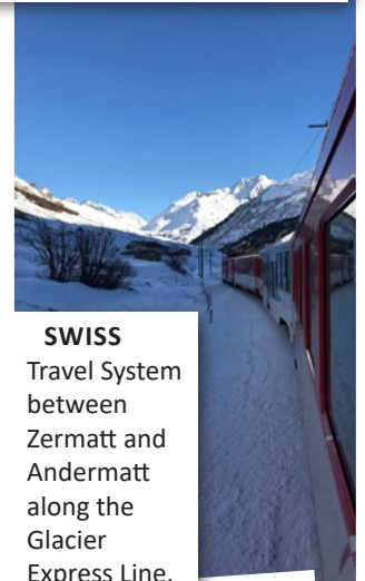
SWISS Travel System between Zermatt and Andermatt along the Glacier Express Line.