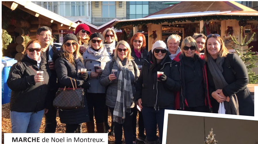
MARCHE de Noel in Montreux.