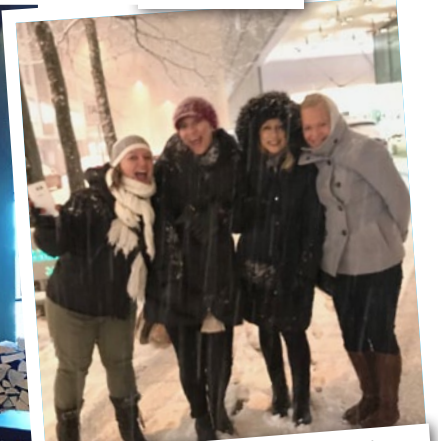
FUN in the snow after a lovely dinner at the Park Hyatt Zurich.