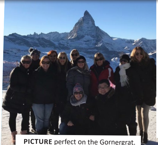
PICTURE perfect on the Gornergrat.