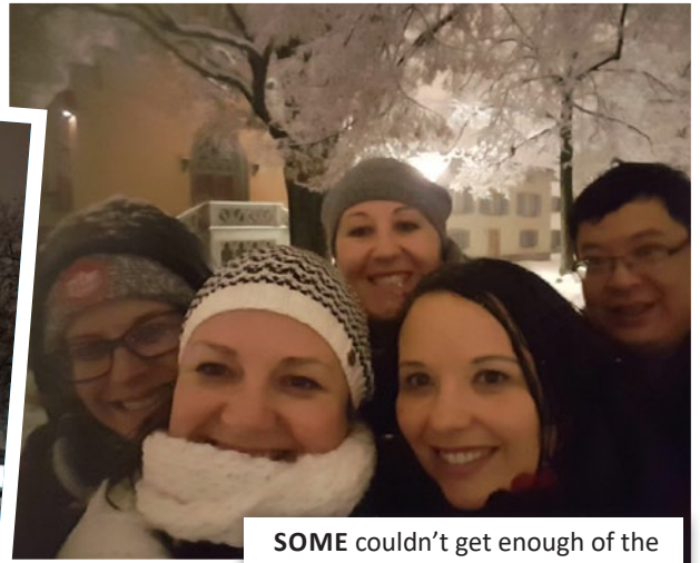
SOME couldn't get enough of the snow in the middle of the night.