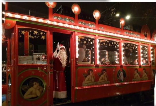
MAERLITRAM in Zurich - St Nik is still watching.