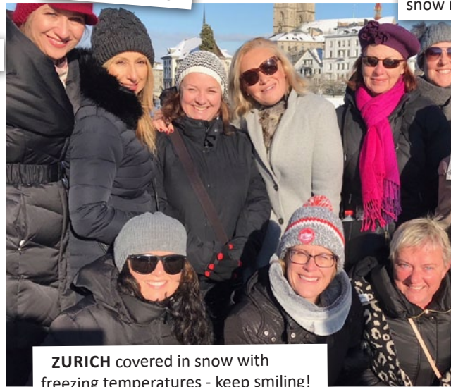
ZURICH covered in snow with freezing temperatures - keep smiling!