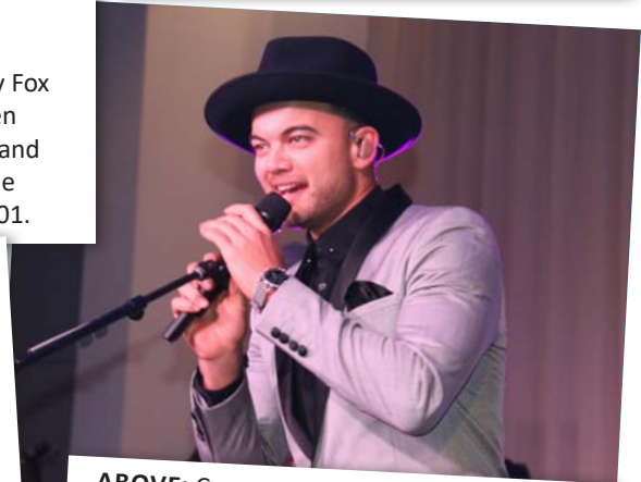
ABOVE: Consummator performer Guy Sebastian and his band wowed the crowd.