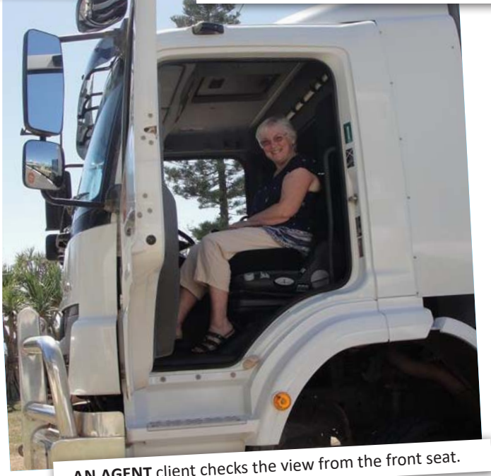
AN AGENT client checks the view from the front seat.