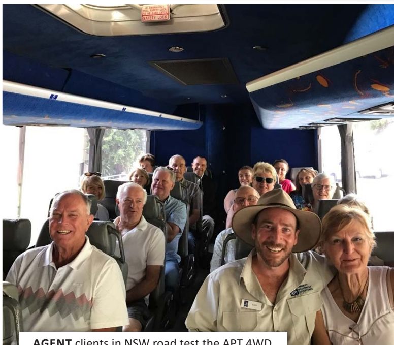
AGENT clients in NSW road test the APT 4WD.