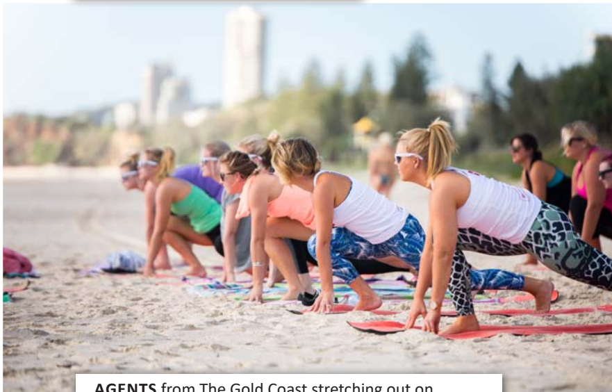
AGENTS from The Gold Coast stretching out on Mermaid Beach.