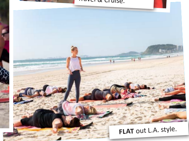
FLAT out L.A. style.