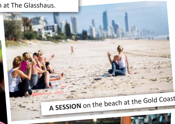
A SESSION on the beach at the Gold Coast.