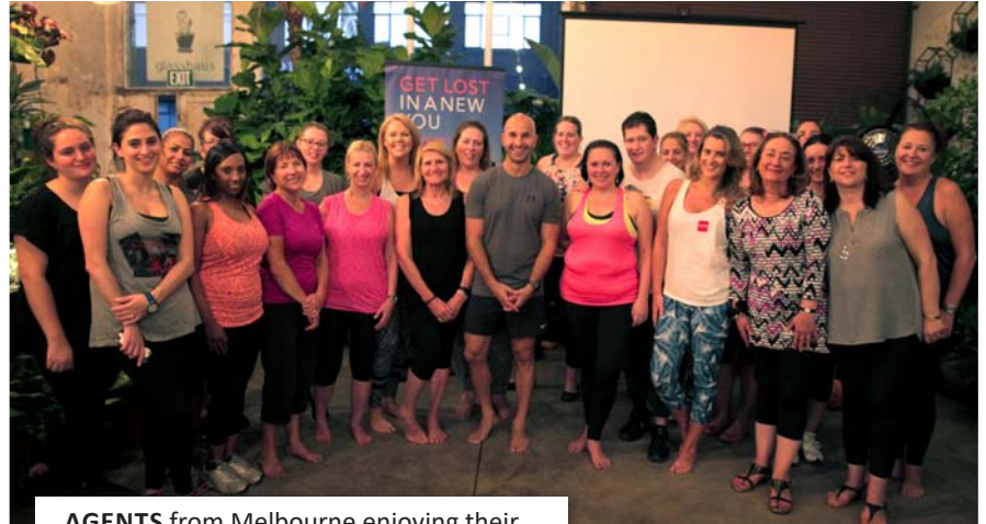
AGENTS from Melbourne enjoying their hip hop yoga session at The Glasshaus.

They learnt that L.A. is more than a glamorous city, with diverse neighbourhoods, shopping precincts and foodie delights hidden around every corner.