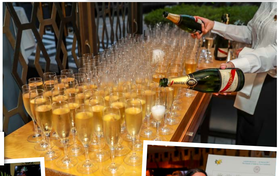
ABOVE: Mumm Champagne, chilled to perfection for guests.