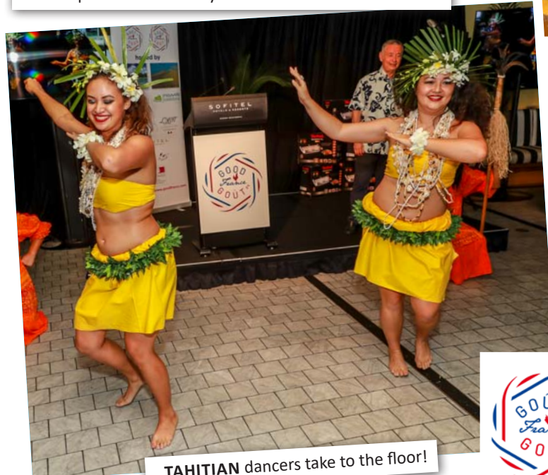
TAHITIAN dancers take to the floor!