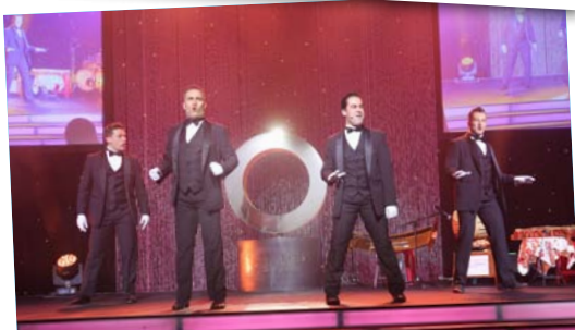
SCENIC Butlers putting on a performance for the audience of over 200 trade partners.