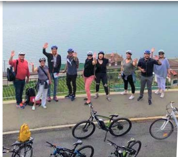
RIDING along the UNESCO World Heritage Lavaux vineyards on the shores of Lake Geneva.