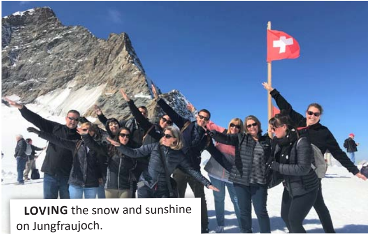
LOVING the snow and sunshine on Jungfrauoch.