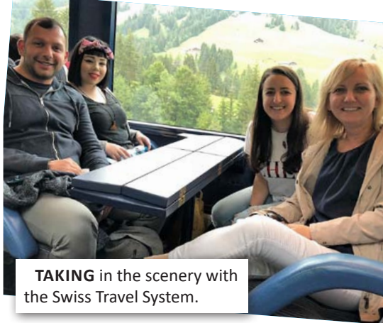
TAKING in the scenery with the Swiss Travel System.