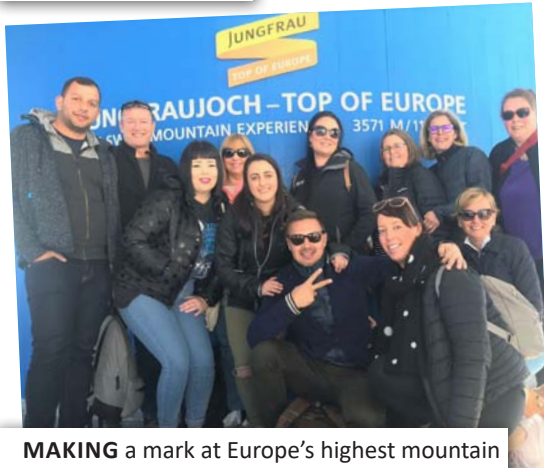
MAKING a mark at Europe's highest mountain railway station, Jungfrauoch, Top of Europe.