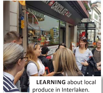
LEARNING about local produce in Interlaken.