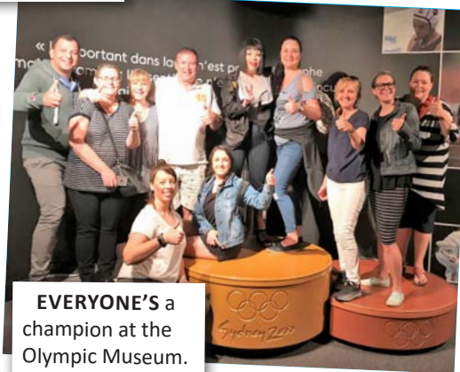
EVERYONE'S a champion at the Olympic Museum.