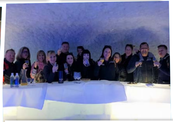
COSYING up at the Ice Palace Bar on Jungfrauoch.