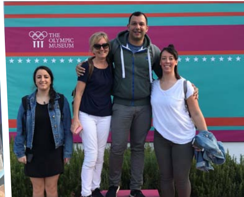
A MOMENT feeling like Olympic Champions at Lausanne's Olympic Museum.