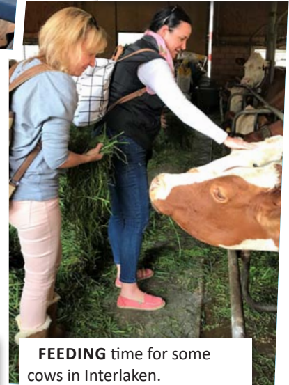
FEEDING time for some cows in Interlaken.