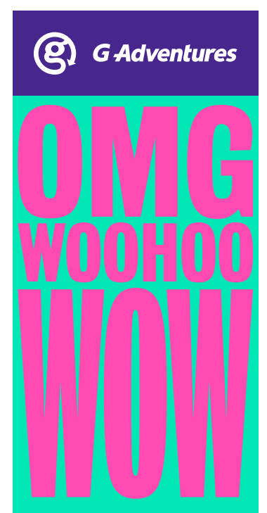
Book 5 travellers to earn your one free tour. 1 July - 19 August 2019

His funeral will take place tomorrow at 11am at Our Lady of Victories Church, Horsley Park.