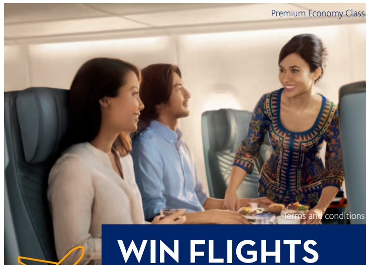
Premium Economy Class