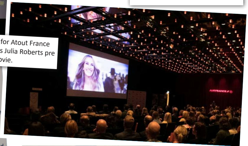
FULL house for Atout France and Lancôme's Julia Roberts pre C'est la Vie movie.