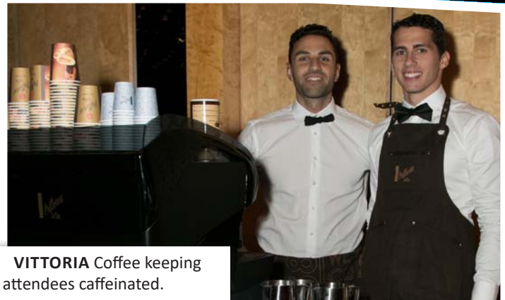
VITTORIA Coffee keeping attendees caffeinated.