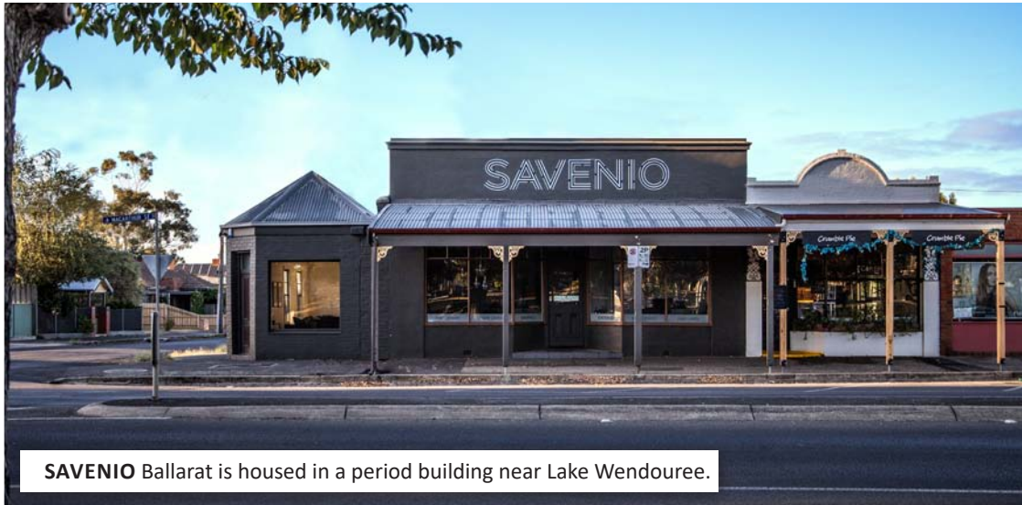
SAVENIO Ballarat is housed in a period building near Lake Wendouree.