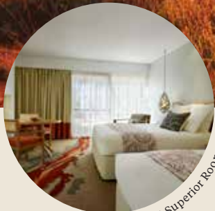
Sails in the Desert Superior Room