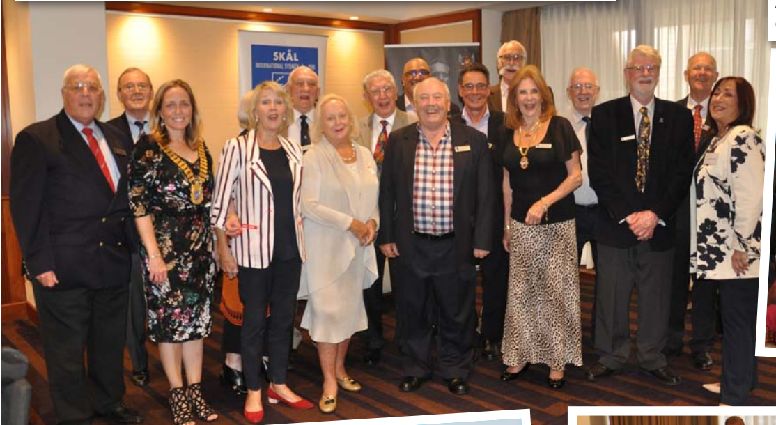
THE impressive line-up of current and past Skäl Sydney Presidents - surely the luminaries of the Sydney travel and tourism community.