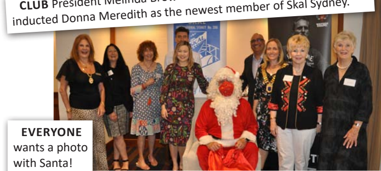
EVERYONE wants a photo with Santa!