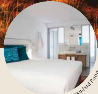
The Lost Camel Standard Room