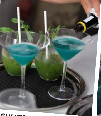
GUESTS were treated to freshly made cocktails.