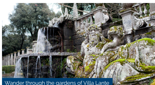
Wander through the gardens of Villa Lante