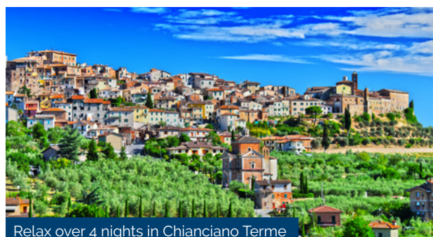
Relax over 4 nights in Chianciano Terme