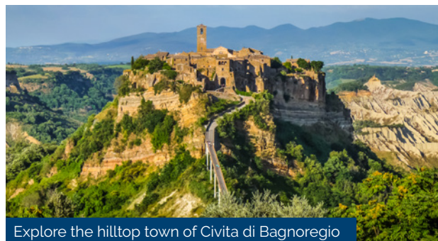
Explore the hilltop town of Civita di Bagnoregio