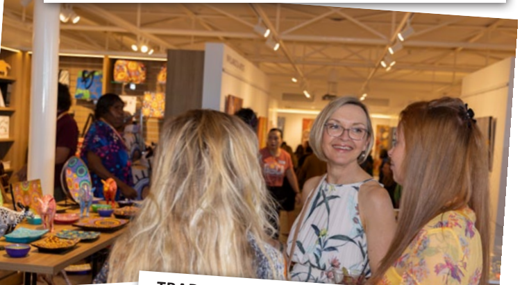
TRADE and media exploring the Gallery of Central Australia.