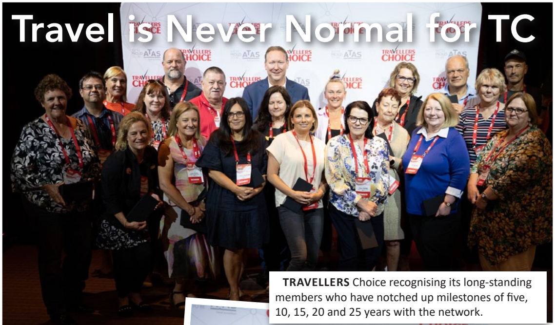
TRAVELLERS Choice recognising its long-standing members who have notched up milestones of five, 10, 15, 20 and 25 years with the network.

The independent travel agency network celebrated the first in-person gathering in three years in style, hosting a conference at the Crown and various entertainment nights at the famous Eureka Tower skyscraper. The group is enjoying a comeback in the market and had plenty of exciting announcements to make.